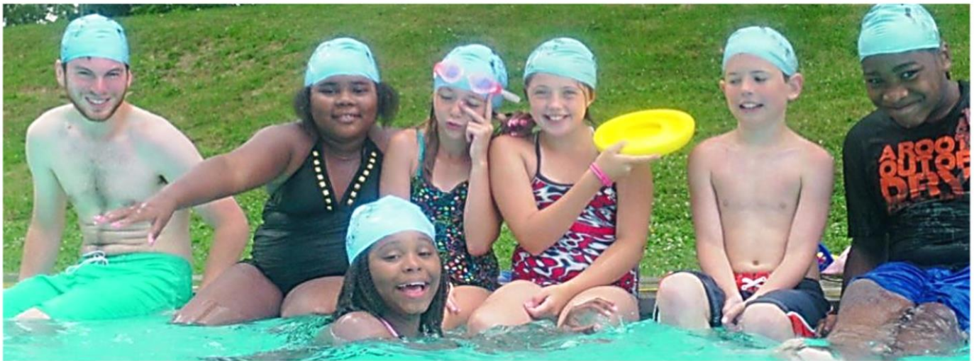
"Kids like to compete, yet boys and girls, fast and slow, can all find roles within their teams and in this game."