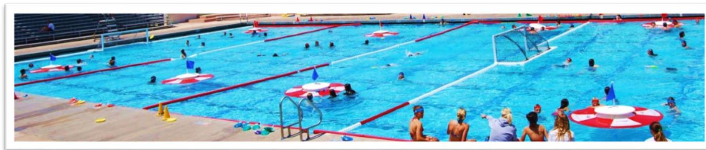
SKWIM Programming is growing in Southern California, where the game was first conceived 30 years ago.