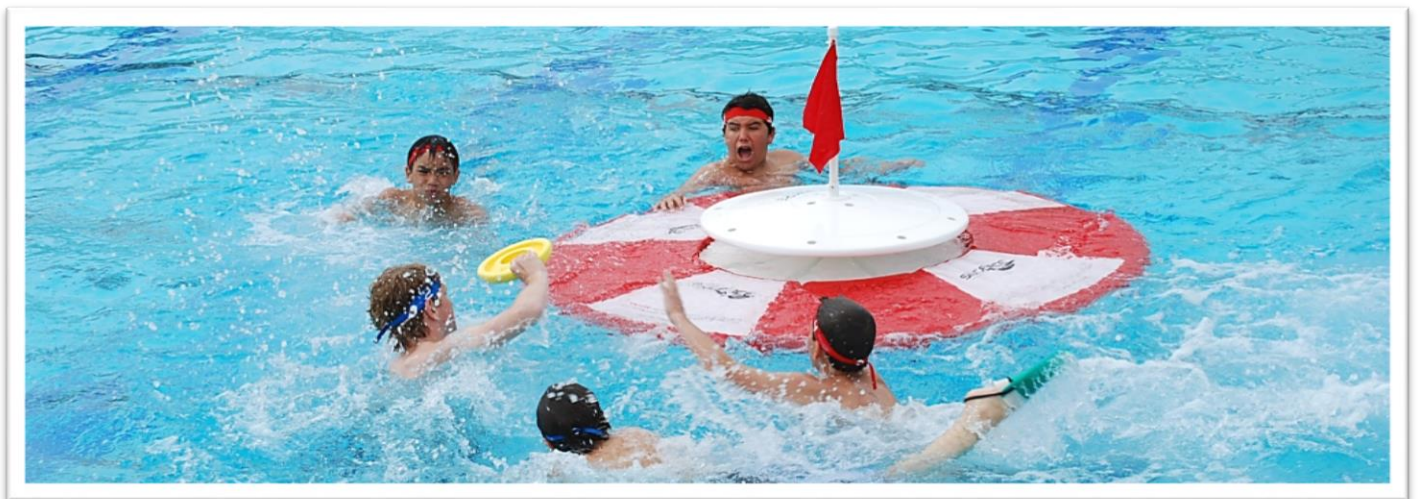
'Goal action' in a school P.E. game of SKWIM, at Corona Del Mar Middle and High School in Newport Beach CA USA

Not only is SKWIM helping local pools and beachfronts by offering community gameplay, this growing water-disk sport is restoring excitement and vigor among lifesavers and coaches who are playing to improve safety, teamwork, fitness and fun in the water!