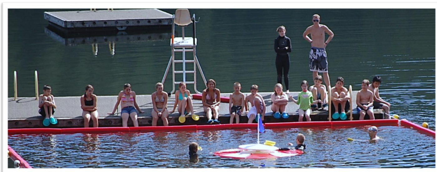
School students on field trip gain open-water SKWIM instruction on Lake Hannan at CYO Camp Hamilton, Monroe WA USA

In an instant, a player can score from any distance or angle, so the game requires heightened awareness in the water, increased skill, movement and flow. Played at the air-water interface, the disk must touch water between offensive players and before a score. There are one, two and three point shots in SKWIM, depending on the distance of the score. SKWIM is one of very few games whereby a goal-to-goal score is not only probable but likely in any given game.