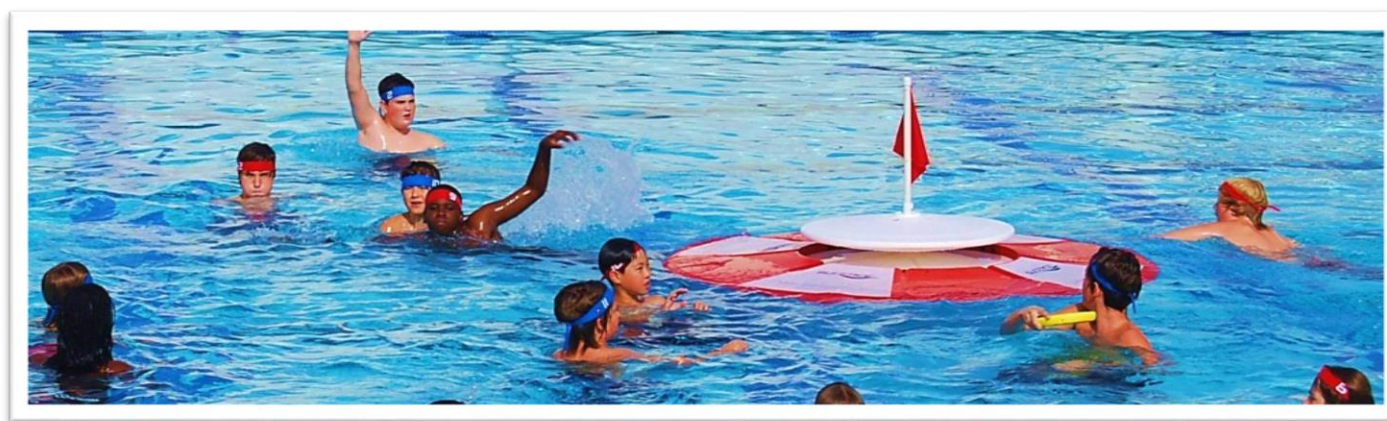
“SKWIM brings the ‘popular-game’ recipe to aquatics, with fresh ingredients and direction.”

Entry to Olympic water sports has traditionally been a steep and narrow path because the prerequisite has been swim racing, and relative to the global sports market, very few kids reach that level of proficiency. “SKWIM begins in shallow water and is played with swim fins in deep water, so entry to team water play is much easier and safer for the beginning swimmer and the general public,” reasons McCarthy, “therefore the path to community aquatic sports participation and competition is now significantly broadened.”