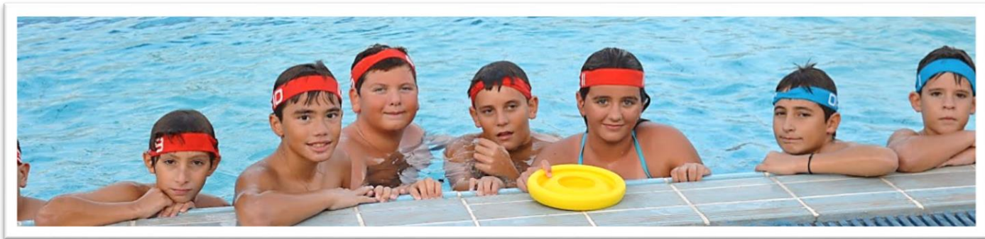
Where ancient disk sports began; SKWIM Hellas players enjoy long summers and mild winters in Chalcis, Greece