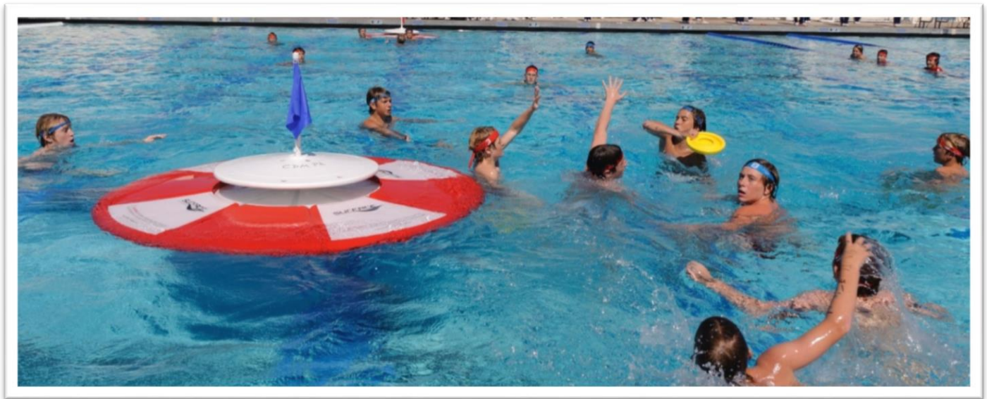
Play intensifies on one side of the goal leaving a lone blue-team player wide open and waiting, in school P.E. action; So Cal USA

In an instant, a player can score from any distance or angle, so the game requires heightened awareness in the water, increased skill, movement and flow. Played at the air-water interface, the disk must touch water between offensive players and before a score. There are one, two and three point shots in SKWIM, depending on the distance of the score. SKWIM is one of very few games whereby a goal-to-goal score is not only probable but likely in any given game.