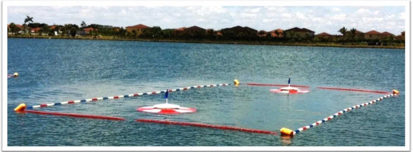
Miami Florida USA, just north of Key Biscayne, an open-water SKWIM System awaits summer camp action.

McCarthy; “SKWIM brings the ‘popular-game’ recipe to aquatics, with fresh ingredients and direction. Every great game has three fundamental ingredients; a specialized implement (ball), unique scoring goal, and performance footwear. For this game we wanted an implement that would glide on the water; be lighter, faster, yet softer for added safety.” The SKWIM Disk, the result of years in design and material testing, can amaze onlookers in a game of catch, but truly captivates a crowd in team competition. The disk can quickly cover 40 meters on the water, made to go straight, to curve, or just plop.