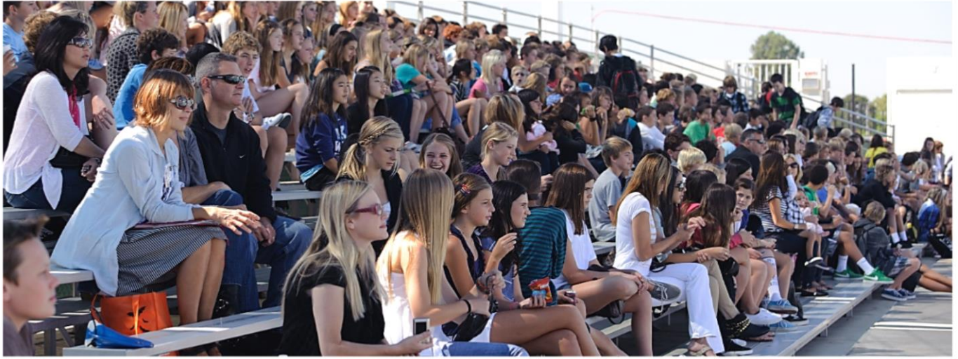
Lower left, a blue SKWIM Fin takes up a seat in a capacity crowd to see this SKWIM P.E. tournament in California